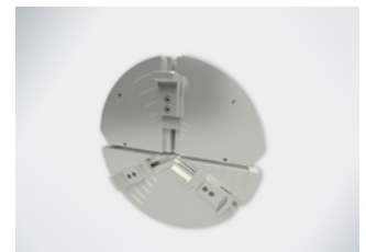
Welding neck support (two-piece)