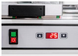
Digital temperature display