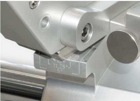
Angle scale The master clamps can be swivelled bilaterally up to 15 deg. (✂ 30 deg.) for the precise production of fittings. The double-sided angle labelling ensures optimum readability from any perspective.