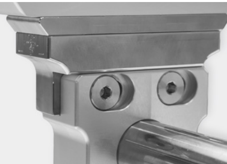
Horizontal adjustability The left-hand clamp on the EasyWeld 180 chassis is included in a design that allows the adjustment in the horizontal dimensions, ensuring easy and professional alignment of pipes and fittings.