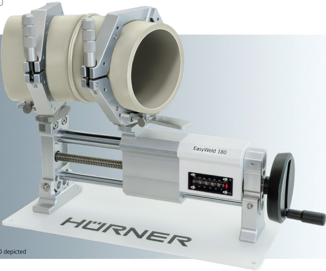
HÜRNER EasyWeld 180 depicted