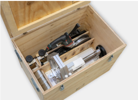
Wooden transport box This high-quality and heavy-duty transport box ensures safe storage of the machine for transport or shipping.