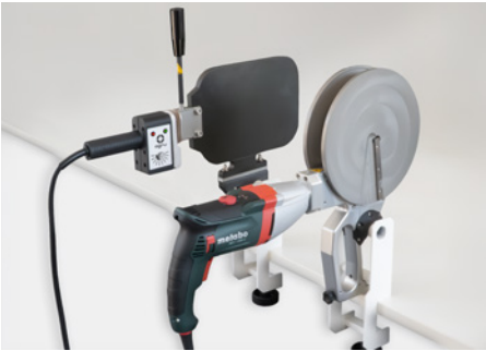
Power facing tool and electr. controlled heating element Part of the system’s standard delivery is an electrical power facing tool, an electronically controlled heating element and two tabletop supports for safe set-down.