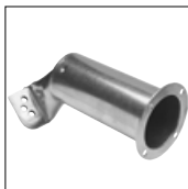
Item No. 12910P2 Overlap welding nozzle, 40 mm for modifying the welding width