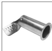
Item No. 1117P2 Overlap welding nozzle, 45 mm for modifying the welding width